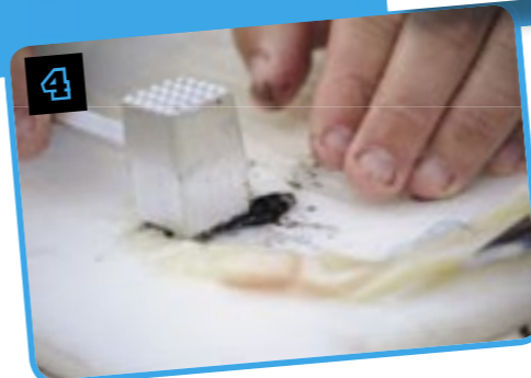
STEP 4 Then smash the ink sac and place it on the tenderised squid.