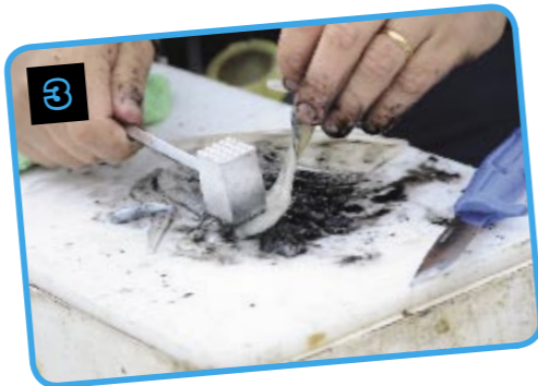
STEP 3 Lightly smash the squid with your squid hammer.