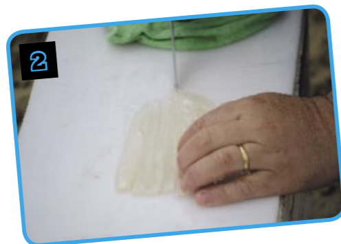
STEP 2 Cut four to six thin strips of squid.