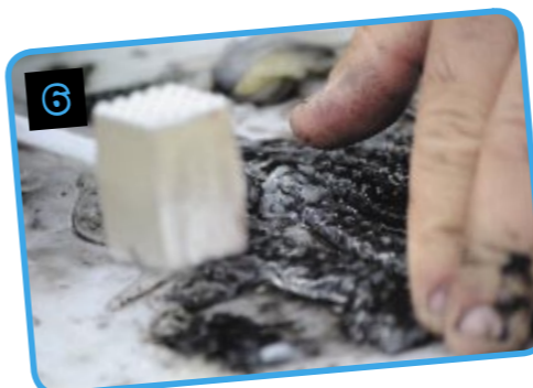
STEP 6 Take the squid guts and smash it onto the squid for added smell.