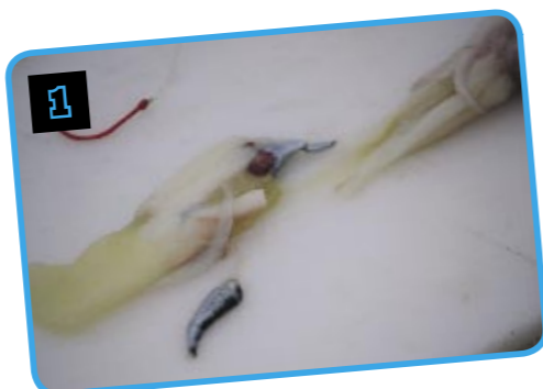
STEP 1 Split the squid, remove the guts and set them aside on the bait box.

I have used this bait often at Kasouga and had loads of success with spotted gullysharks, smoothhounds, kob and a variety of ray species. Used in combination with the squid guts for extra smell, this is one of the best squid baits to use. It is a squid bait that will definitely improve the results of your future fishing outings for those elusive kob, sharks and rays.